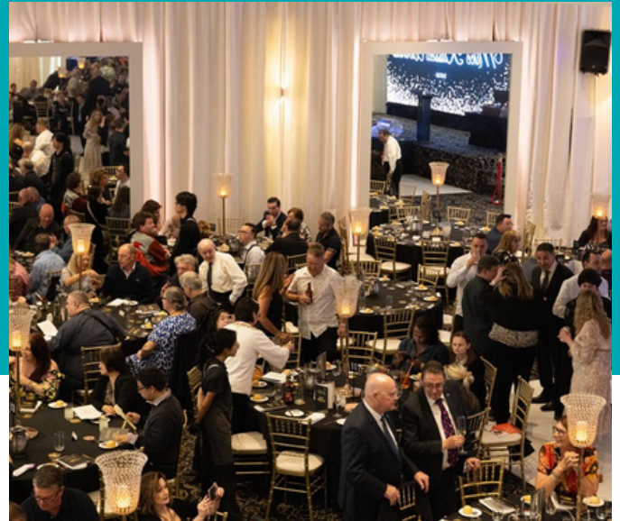
Above: The room was buzzing with conversation and laughter.

It was a wonderful evening celebrating our amazing Workmates of Waverley and everything they've achieved.