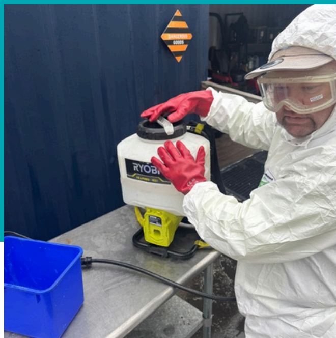
Above: Handling dangerous chemicals training using PPE.

“Typing and navigating a laptop isn’t second nature for most of them, but they embraced it with such a positive attitude.”